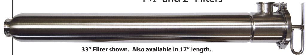
33" Filter shown. Also available in 17" length.